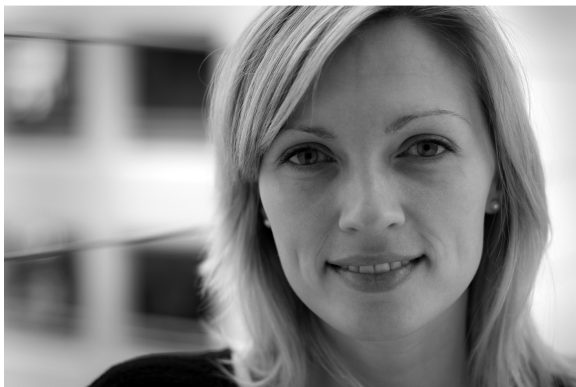
FIGURE 6. Photograph of a woman taken with a focal length lens of eighty millimeters.