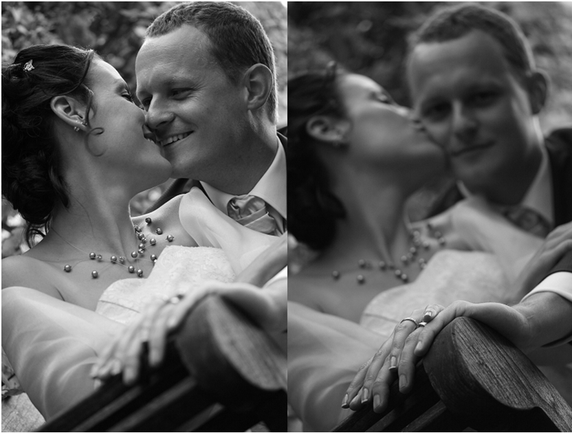
FIGURES 3 and 4. Photograph of couple taken with an aperture setting of 2.8 (left). Photograph of couple's rings taken with an aperture setting of 2.8(right).