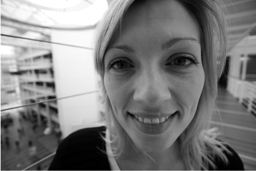
FIGURE 7. Photograph of a woman taken with a focal length lens of sixteen millimeters.