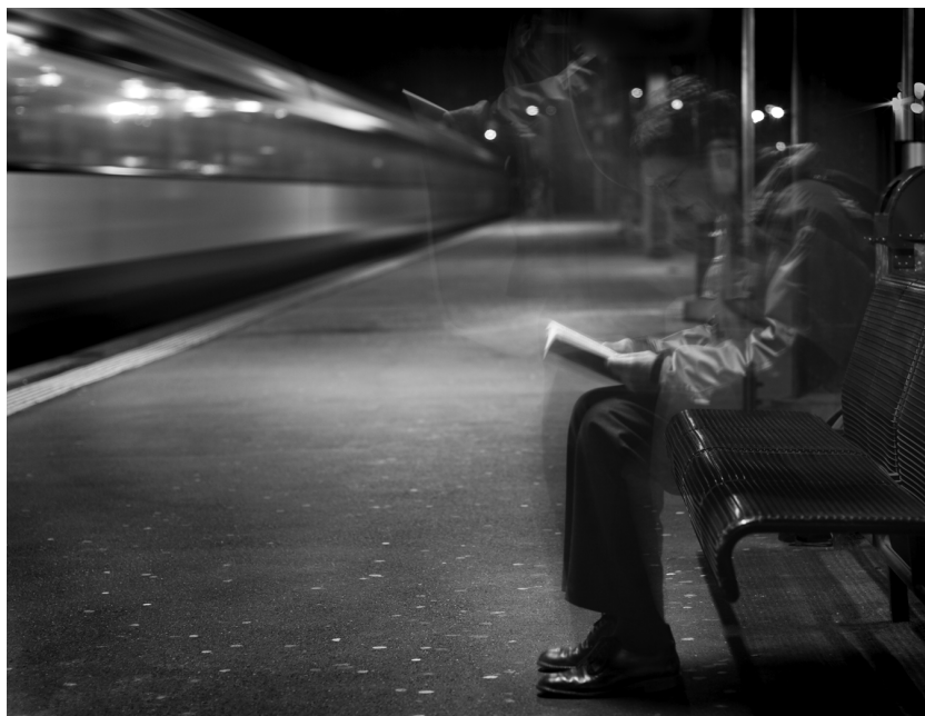
FIGURE 8. Photograph of a person and a train taken with a shutter speed setting of two seconds.

a sharp photograph that shows many details, and the latter can be used, for instance, as an illustration in a paper about perdurantism, to show that some material objects are temporally extended (that is why I did this photograph sometime ago in the first place [see Benovsky 2009]). It is worth mentioning that it would not be correct to say that a sharp photograph (taken with a shorter shutter speed) would be more factive than the photograph in Figure 6. Granted, due to more sharpness some more detail would be preserved (so on this point the sharper photograph would be more factive), but some other information would simply be lost by comparison with the photograph in Figure 8, namely, information about how the objects evolved through time, how they moved, and so forth (on this point the sharper photograph would be less factive). Thus, both the sharp and the less sharp photographs are partly factive (again, I shall come back to partial factivity in the next section), but no one of them is fully factive, and no one of them is clearly more factive than the other.