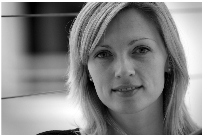
FIGURE 5. Photograph of a woman taken with a focal length lens of 320 millimeters.